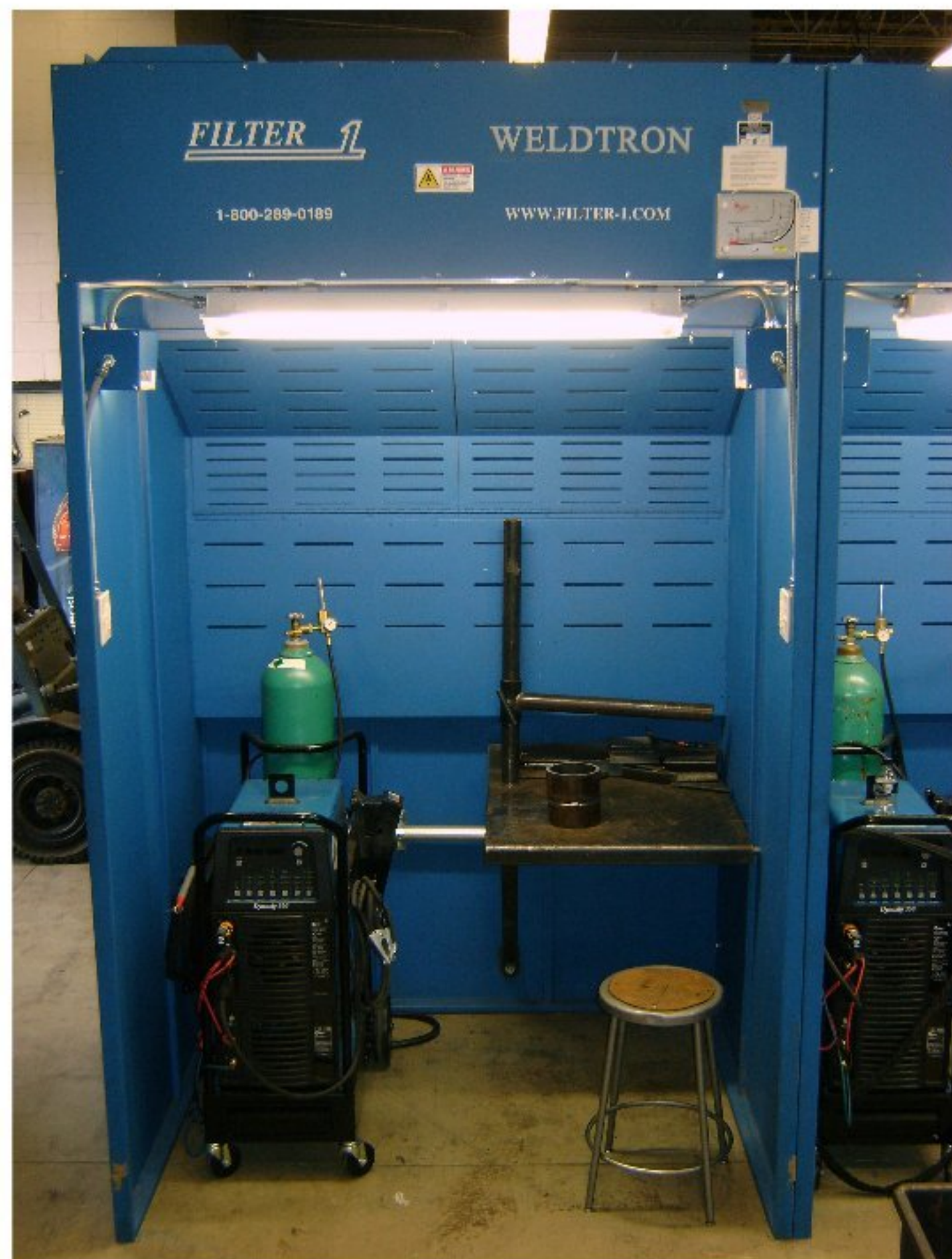
Weldtron 2000-IWS 6' Wide, 8' Tall Inside